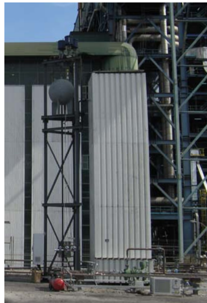
700 kWh (13000 kg) sodium nitrate PCM storage for 300 °C applications