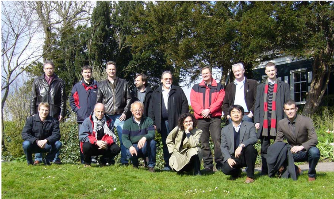
Annex 21 Team