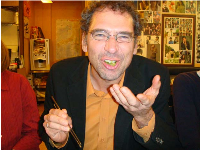
The secretary enjoying the hot and spicy Korean food at the Fall meeting in Seoul