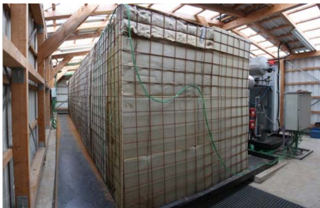
400 kWh sensible concrete storage module for heat storage in the 100-400 °C range

The “state of the art” report is a sound basis for further development of existing as well as the development of new advanced storage systems, and indicates that there is still a strong demand for further improvements to reduce investment cost, performance and reliability of storage systems.