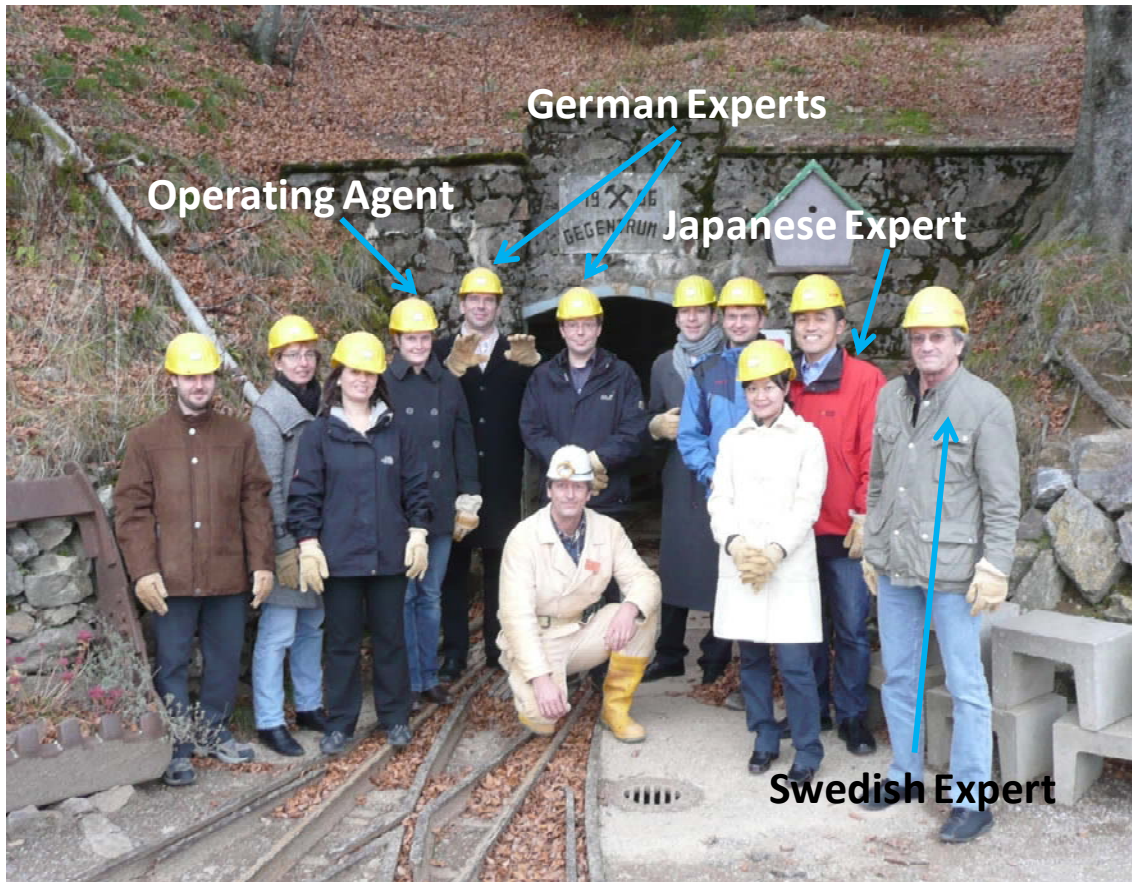
Annex 18 -- Mastering Challenges in Thermal Energy Transportation with Advanced Thermal Energy Storage Technology for Sustainable Energy Systems