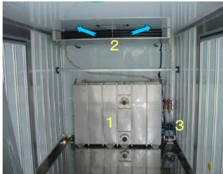
Elements of the Eco-run-cool refrigeration container: (1) dynamic ice storage tank; (2) forced convection air cooler; (3) ice slurry circulation pump. Saving up to 30% CO 2 emissions as compared to conventional on-board cooling.

At the end of the year, two demonstration projects for the external utilization of industrial waste heat by means of advanced energy transportation was under way within the annex 18 partners. Also, an extensive R&D project on pumpable solutions like Phase Change Slurries using micro-encapsulated PCM or emulsions is in progress. Several projects for using thermal energy storage in vehicles are being monitored.